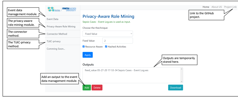
Fig. 2: The privacy-aware role mining page in PPDP-PM.

for the privacy preservation techniques. The privacy-aware role mining module (Figure 2) implements the decomposition method supporting three different techniques: fixed-value , selective , and frequency-based [6]. After applying a technique, the privacy-aware event log in the XES format is provided in the corresponding “Outputs” section. The generated event log preserves the data utility for mining roles from resources without exposing who performs what.